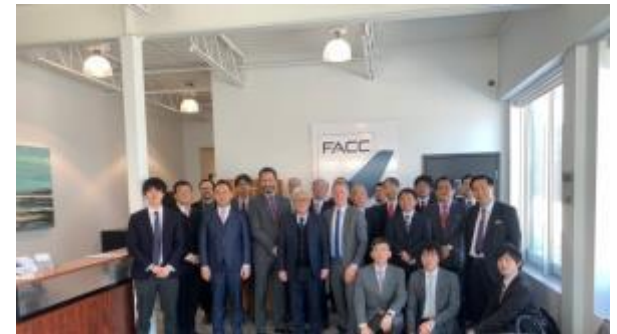
Inspection Tour to Canada 2019